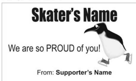
Stamp Advertisement #5