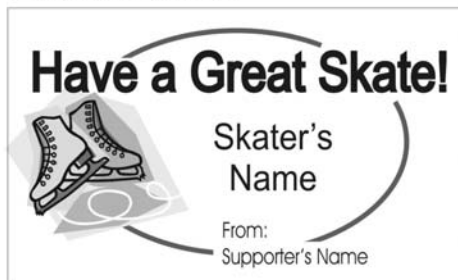
Stamp Advertisement #2