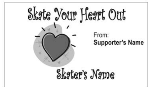
Stamp Advertisement #3