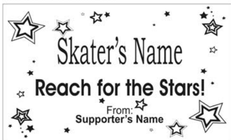
Stamp Advertisement #1